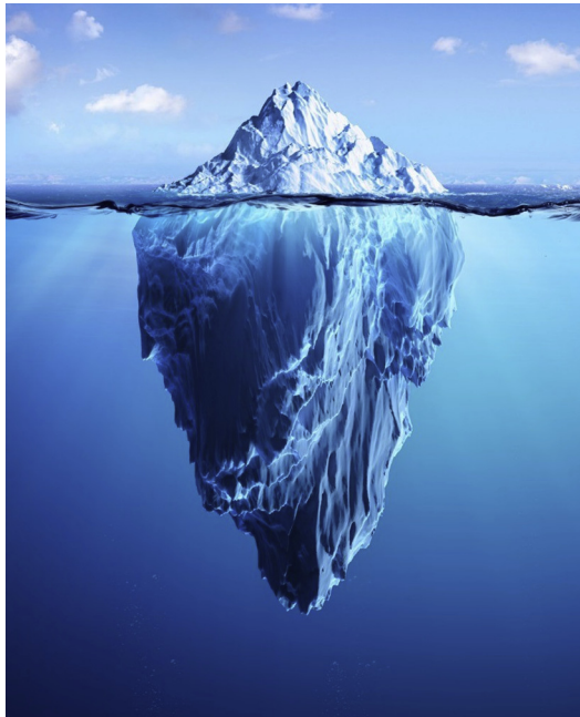
Fig. 1. Most patients are never counted.

A state-of-the-art, NIMH-funded study of posttraumatic stress disorder (PTSD) provides a good illustration of a sham control group. 12 The study focused on “single incident” PTSD. The patients were previously healthy. They developed PTSD after experiencing a specific identifiable trauma. The study claims to compare psychodynamic therapy with a form of CBT called prolonged exposure therapy. It claims to show that CBT is superior to psychodynamic therapy. This is what it says in the discussion section: “[CBT] was superior to [psychodynamic therapy] in decreasing